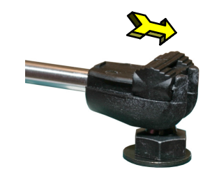
C. Slide clip over ball-stud to lock end-fitting