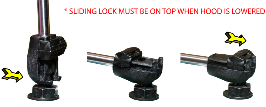
A. Snap on socket