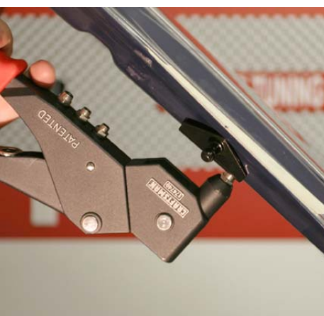
Riveting Tips: Visit http://www.redlinetuning.com/QL-tips.html